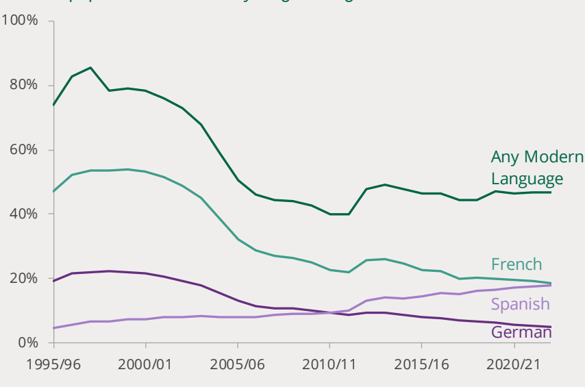
% of all pupils at the end of key stage 4, England